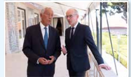
Visiting the Portuguese President in July 2023

He did not take this decision lightly. The decision-making process took three weeks before he agreed and gave up all his positions, at the bank, at the Chamber of Commerce and at the law firm. He wanted to be able to devote himself fully and unconditionally to his new, old role as a politician.