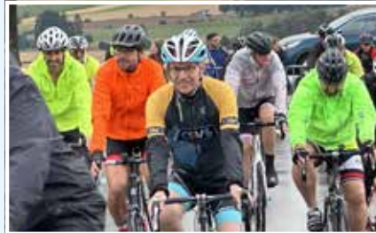
Luc Frieden rides on the campaign trail

Was this career predetermined? No. Luc Frieden grew up as the son of an Arbed employee and a teacher in Esch/Alzette. He attended the local school, played with the kids of the neighbourhood, went to music school and to the swimming club.